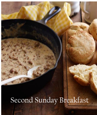
Second Sunday Breakfast