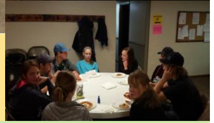
Youth Group Lock-in was January 8th & 9th. There were 15 in attendance. The group had fun playing games and making their own