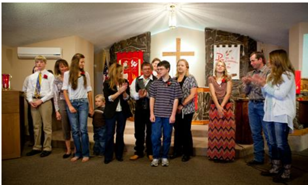
Confirmation Sunday, October 27, 2013 Confirmed students and their families

Workshops: Games, Drama, Art/Craft, Movie or Music Key verse: "So the shepherds went with haste and found Mary and Joseph and the child lying in the manger." Luke 2:16